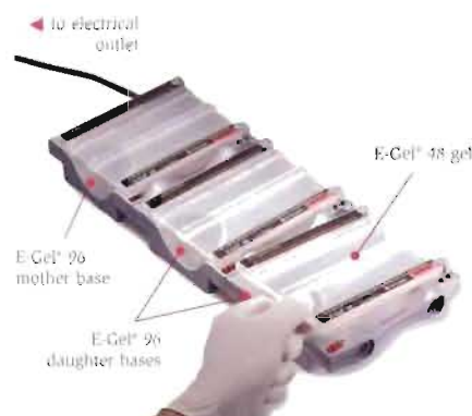
figure 1 - the E-Gel® 48 gel runs in the E-Gel® 96 mother and daughter bases

includes two rows, each containing 24 sample and 2 molecular weight marker wells. The well spacing allows loading with an 8- or 12-multichannel pipettor. For your convenience, fully automated robotic loading is also possible. You'll quickly load samples and be on your way to analyzing results.