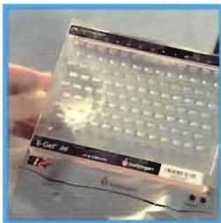
A. Set up